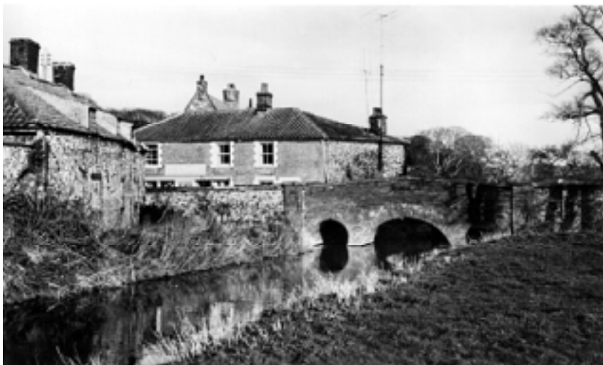
River Stiff and Stiffkey Bridge